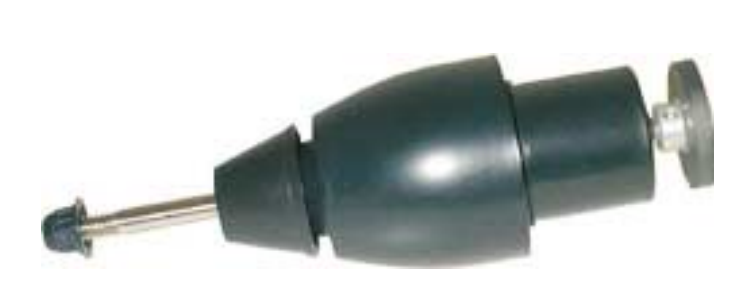
WS-05162 - Complete nose cone and propeller shaft assembly including O-ring

Please contact your supplier for details of other replacement parts as required.